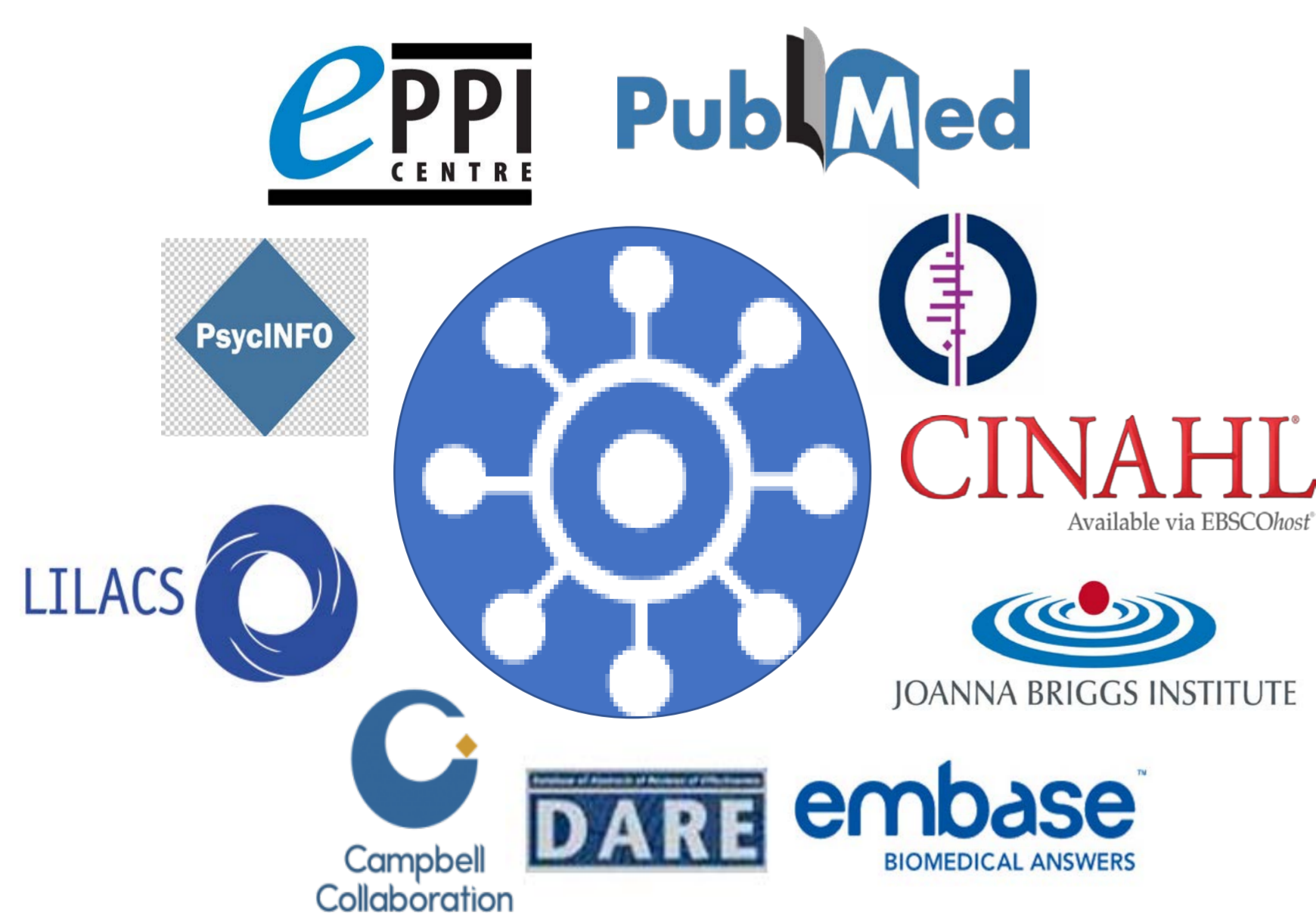
Figure 1: Databases where systematic reviews are collected

The maintenance of a living overview of systematic reviews where humans and robots collaborate, will enable access to the best available evidence in real time; at its core are systematic reviews with assessment of certainty performed with GRADE, and created through an international collaborative system.